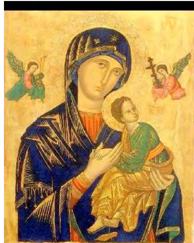
Our Lady of Perpetual Succour 27th June