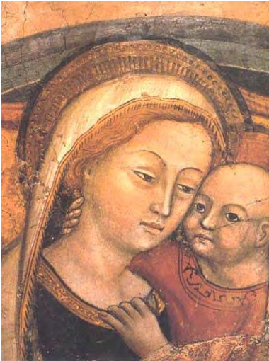
Our Lady of Good Counsel